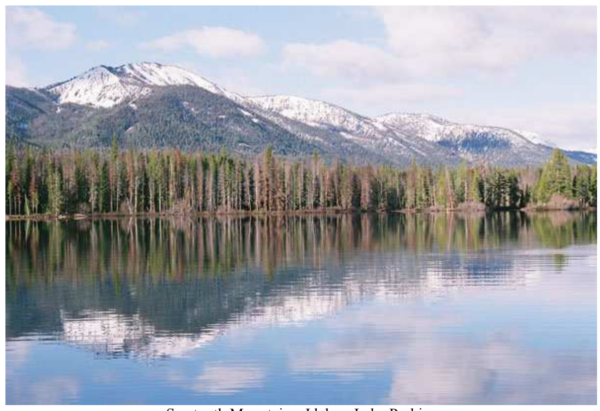
Sawtooth Mountains, Idaho - Lake Perkins